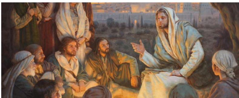
Jesus and his disciples

Christians, Easter , church, Jesus , disciples , loyalty , forgiveness