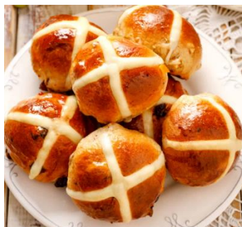
Hot cross buns