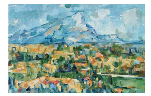
Mount Sainte Victoire (1895 left, 1904 right)