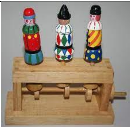
Victorian toys which use cams to produce movement

Junior hacksaw, G clamps, bench hooks, hand drill.